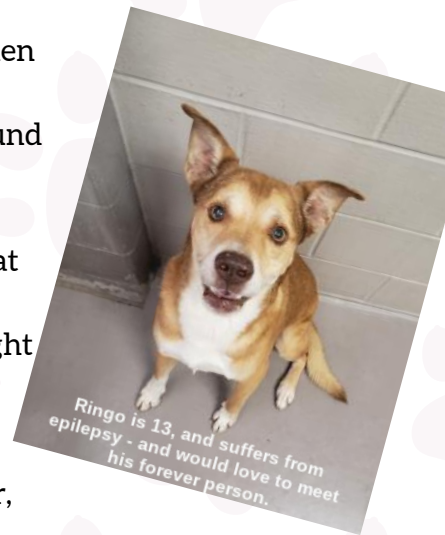
Ringo is 13, and suffers from epilepsy - and would love to meet his forever person.