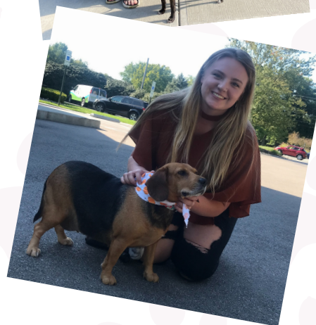
Pictured: local families are able to provide their pets the gift of spay/neuter, thanks to your support!